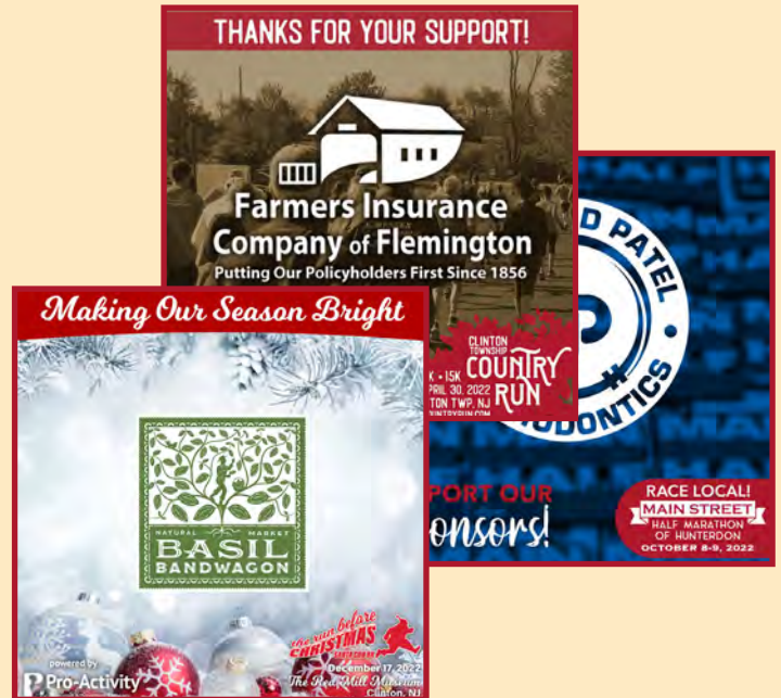
SOCIAL MEDIA MENTIONS, including dedicated or shared post spots and re-shares of your own content with endorsements