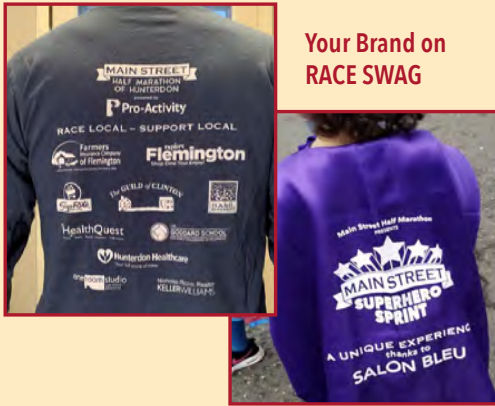
Your Brand on RACE SWAG

Some of the ways we partner with your brand to give you the support your commitment deserves.