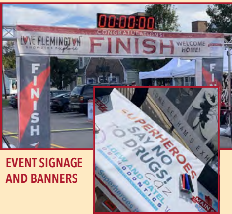
EVENT SIGNAGE AND BANNERS